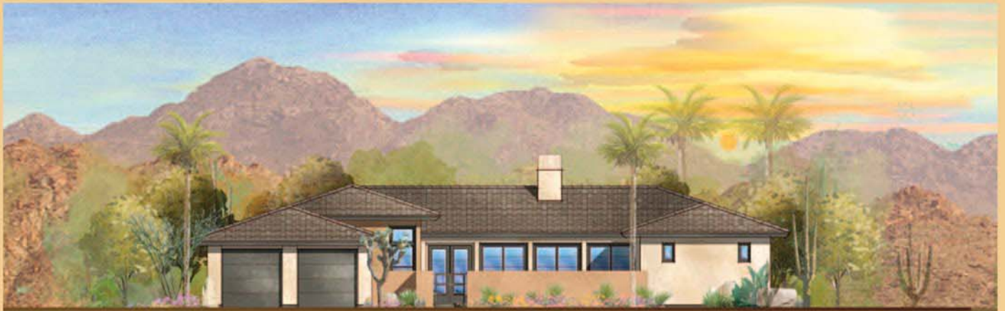
Style A: Desert Traditional