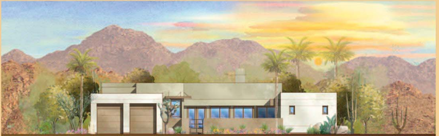
Style B: Desert Contemporary