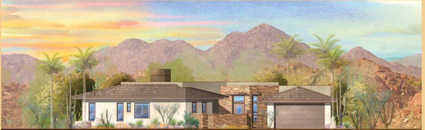
Style A: Desert Traditional