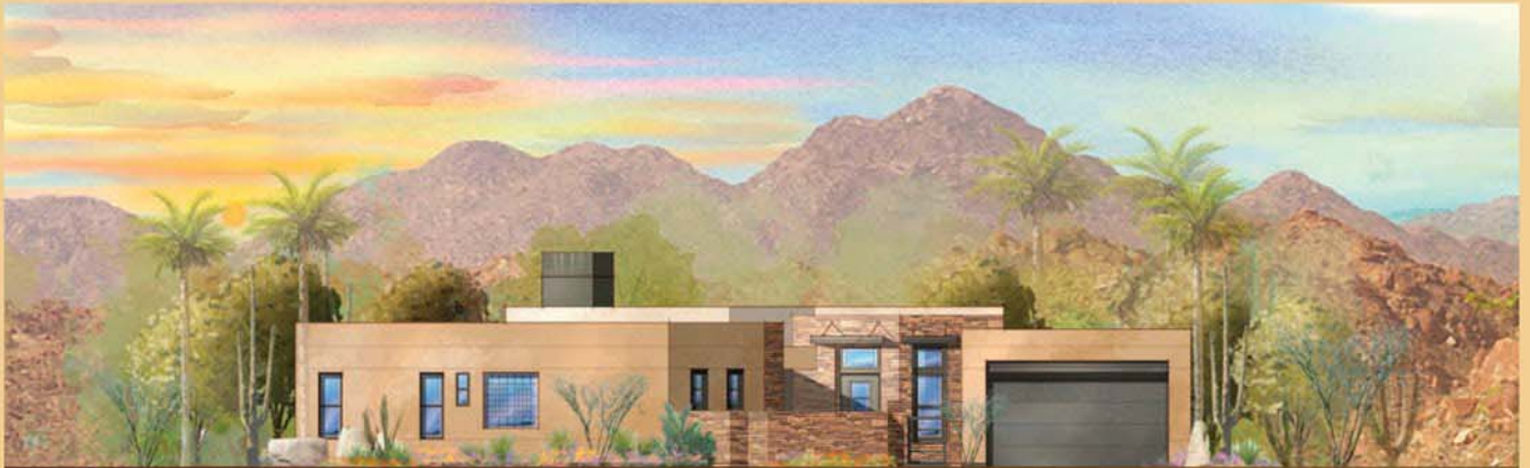
Style B: Desert Contemporary