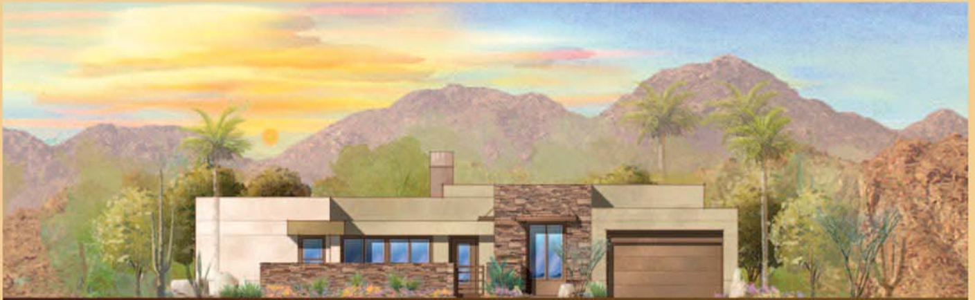
Style B: Desert Contemporary