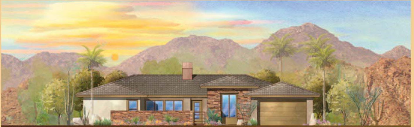
Style A: Desert Traditional